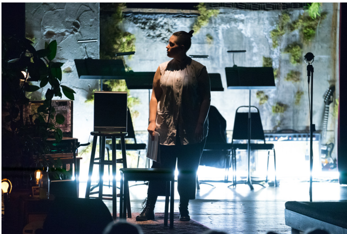
A Fond Farewell —a chamber music collaboration between Third Angle New Music and Hand2Mouth Theatre reimagining the music of singer-songwriter Elliott Smith.