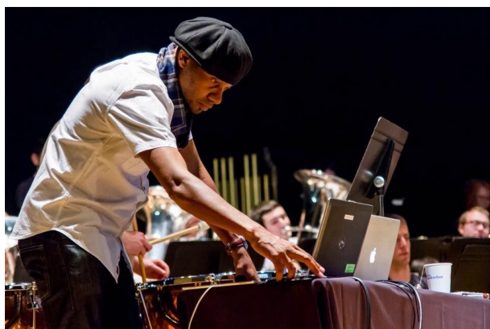
Composer, multimedia artist, writer Paul D. Miller aka DJ Spooky, rehearsing Heart of a Forest with the Oregon State University Wind Ensemble.

Several grantees have had to learn how to contract with new artists, specifically artists working outside the grantee’s primary arts discipline. Monitoring and holding artists to a delivery schedule was also a challenge within several projects. Some organizations were stunned when artists developed work outside the host organization’s comfort zone, especially regarding language deemed potentially inappropriate to audiences. Be prepared for artists working in new ways with new methods, technologies, languages.