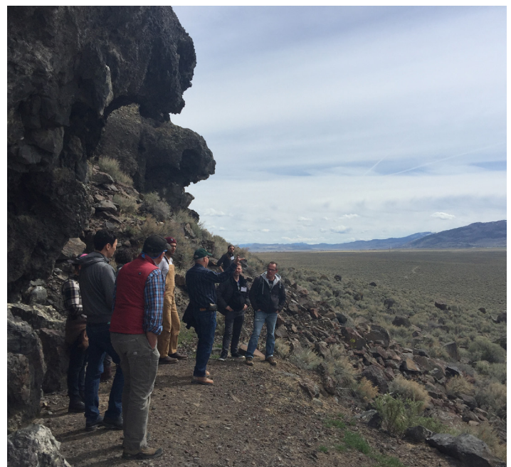
Workshop with artists and scientists in Central Oregon, High Desert Museum Water in the West (2018)