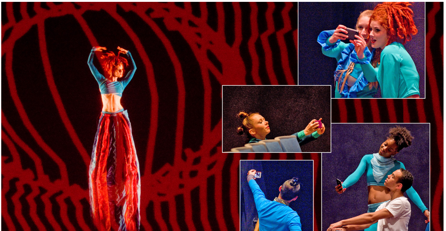
Rainbow Dance Theatre's SELFIE