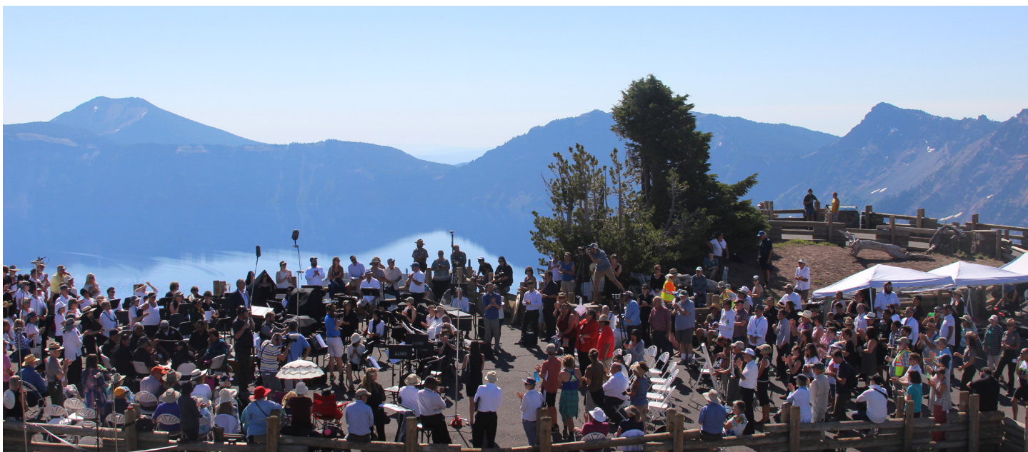
Britt Music and Arts Festival performing Michael Gordon's Natural History at Crater Lake.