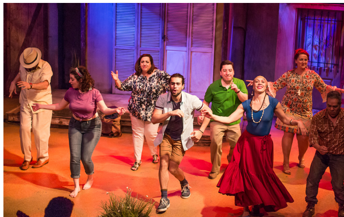
Milagro Theater performing Óye Oya, an original Spanish-language musical based on Cuban history and culture.

We have come to realize that risk is inherent in all creative work, and innovation is trying something new. The term “stretch” embraces what grantees are doing—extending in new ways and with new partners, testing and growing their missions and, most often, developing new work.