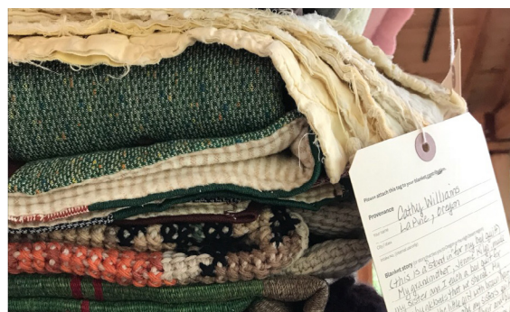
Artist Marie Watt's Blanket Tower , part of the exhibition Art for a Nation at the High Desert Museum (Bend)