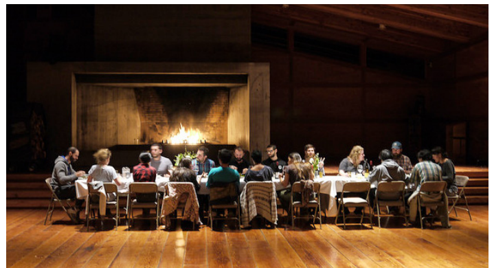
Creative Exchange Lab, Portland Institute for Creative Arts

Even with the best planning and preparation, you can expect the unexpected. Almost all projects have experienced some kind of unexpected event, from a natural disaster that destroyed a music director’s studio, to delays in receiving artist visas, to changes (even death) of collaborating artists. Grantees are learning the importance of having some flexibility in time and budget, and having a back-up plan ready (or at least being able to craft one quickly.) More than one grantee discussed how important it is to provide for artists quality lodging, food, and an environment conducive to creating new work. In the development of collaborative work, artists will not always know in advance what they need to reach excellence.