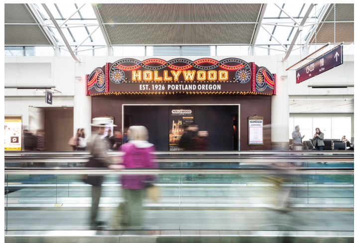
Hollywood Theatre's new cinema at the Portland International Airport – showcasing short films by Oregon filmmakers.